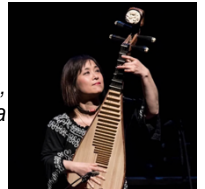
Wu Man, Pipa